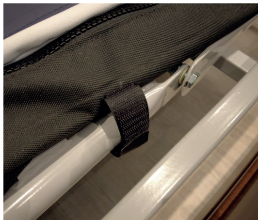
3 Attach the system to the bed using the straps on the cover