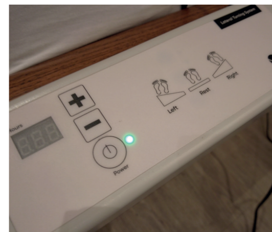
7 Power on the pump