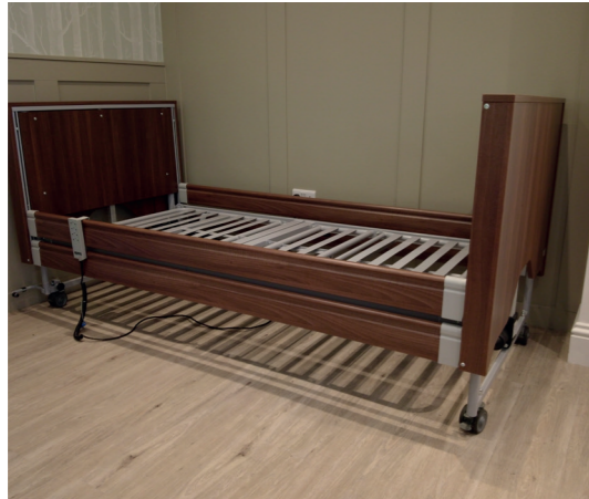
1 Remove the mattress from the bed