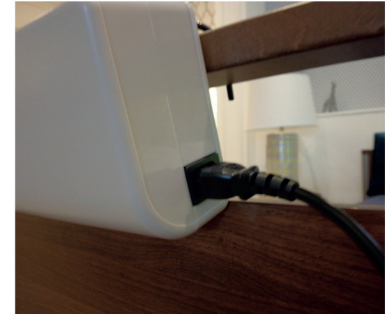
6 Insert the hose connection to the pump and connect the power cord