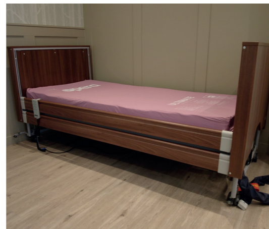
4 Place the mattress back onto the bed, on top of the Autoturn system