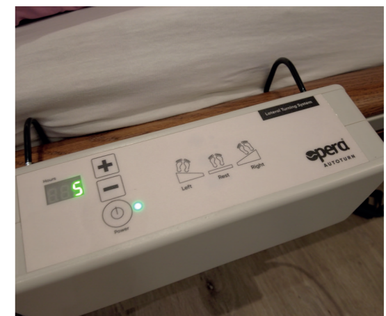
8 Set the timer using the + and - buttons (The number in the timer indicates how many hours the system should run automatically.)