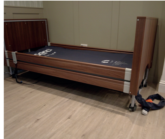
2 Place the Autoturn system on the bed base, the hose connection should be at the foot end of the bed